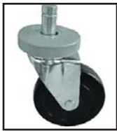
Optional Casters Available