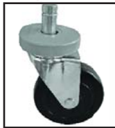
Optional Casters Available